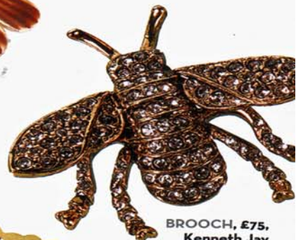
BROOCH, £75, Kenneth Jay Lane, from my-wardrobe.com